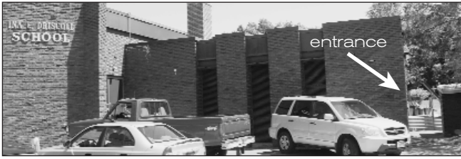
Miller-Driscoll School: 336 Belden Hill Road South Entrance

Instructors will present individual class schedules at their first session.